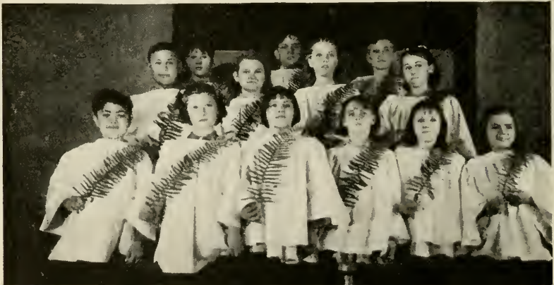
The Wesley Community House junior choir, Oklahoma City